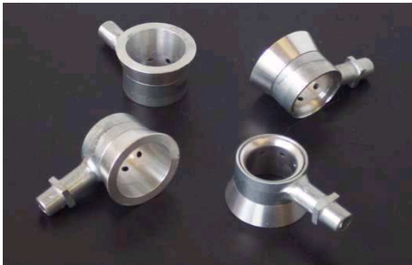
Pictured is 1.750". Many more sizes available: 1.875, 2.000, 2.125, 2.250".